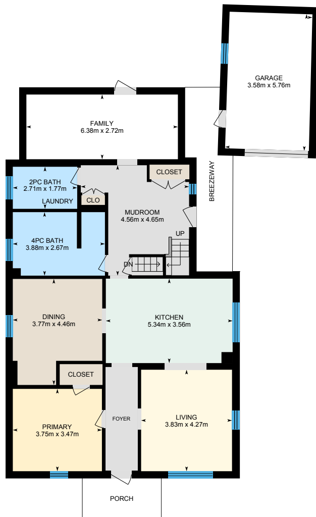
Main Floor Exterior Area 127.46 m 2

Main Building: Total Exterior Area Above Grade 218.72 m 2